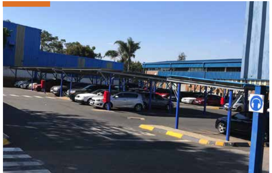
Industrial development at Chlookop