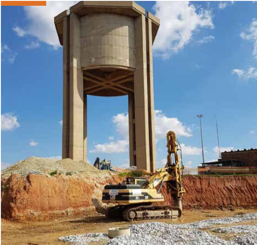
Rapid impact compaction at Zulu Xhosa Reservoir