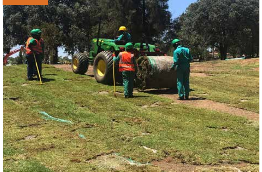
Landscaping at modderfontein golf course