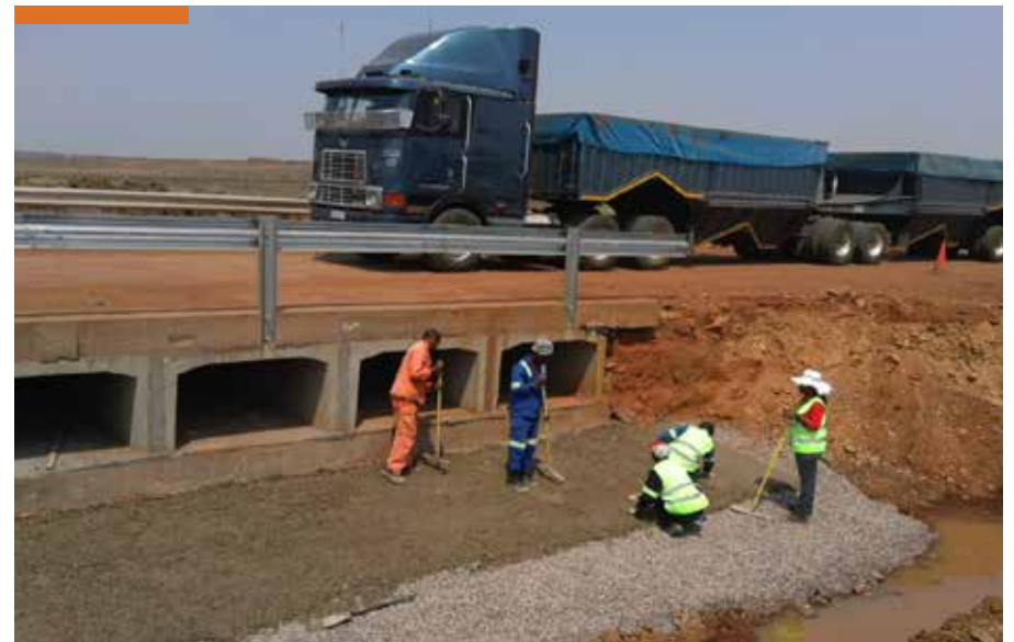
Construction of culvert bridge on road between Middleburg and Wonderfontein