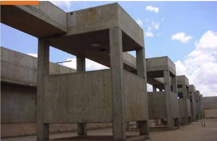
Construction of wastewater reactor basin