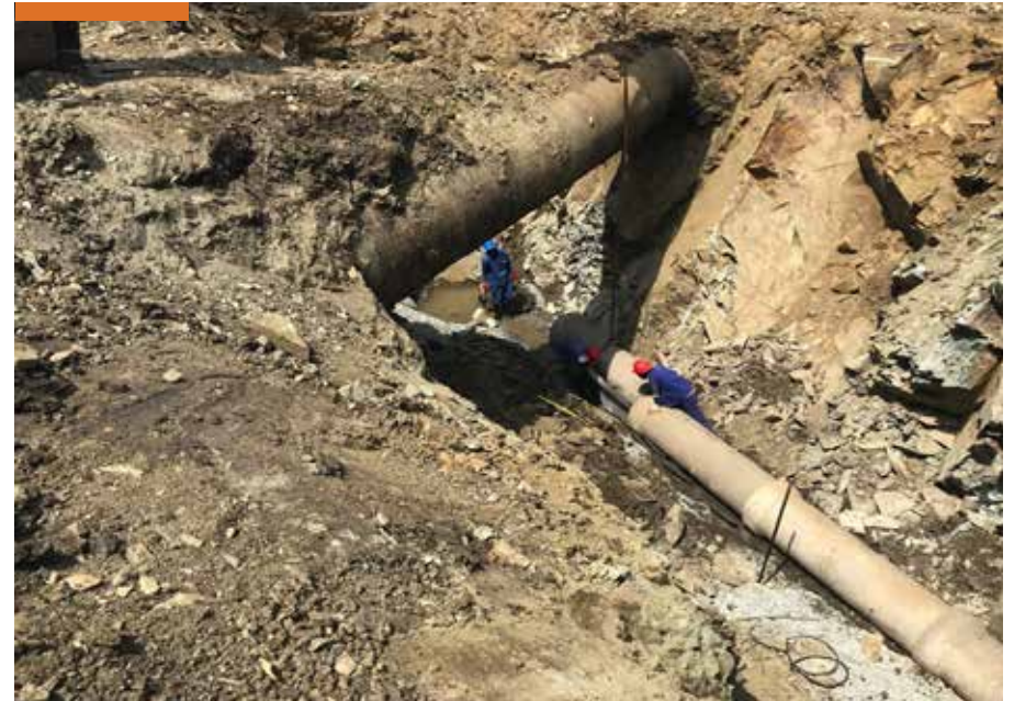
Construction of Illiondale outfall sewer